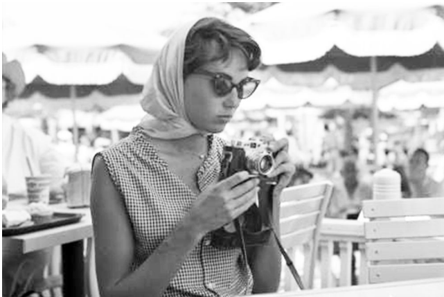
The young film student in Los Angeles with her new Leica M3