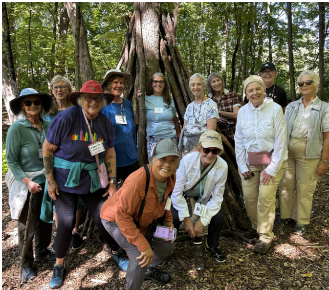
The Hikers gathered in August for a hike at the Elm Creek Park Reserve.