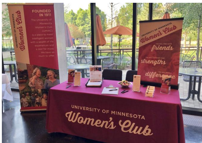
Our booth with new materials at the AFU Day event

It was a busy summer for the club, too. In fact, we didn't miss a beat, starting with a wonderful day at the University of Minnesota's Age-Friendly University event in June, which you can read about on the following page. To get ready for that event, we produced banners, a new membership brochure, interest section cards and a table cloth that I think provide a fresh and contemporary look.